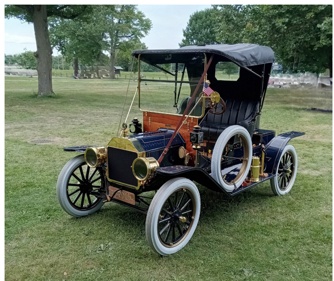
Best of Show – brass era car, 1911 Ford Model T.