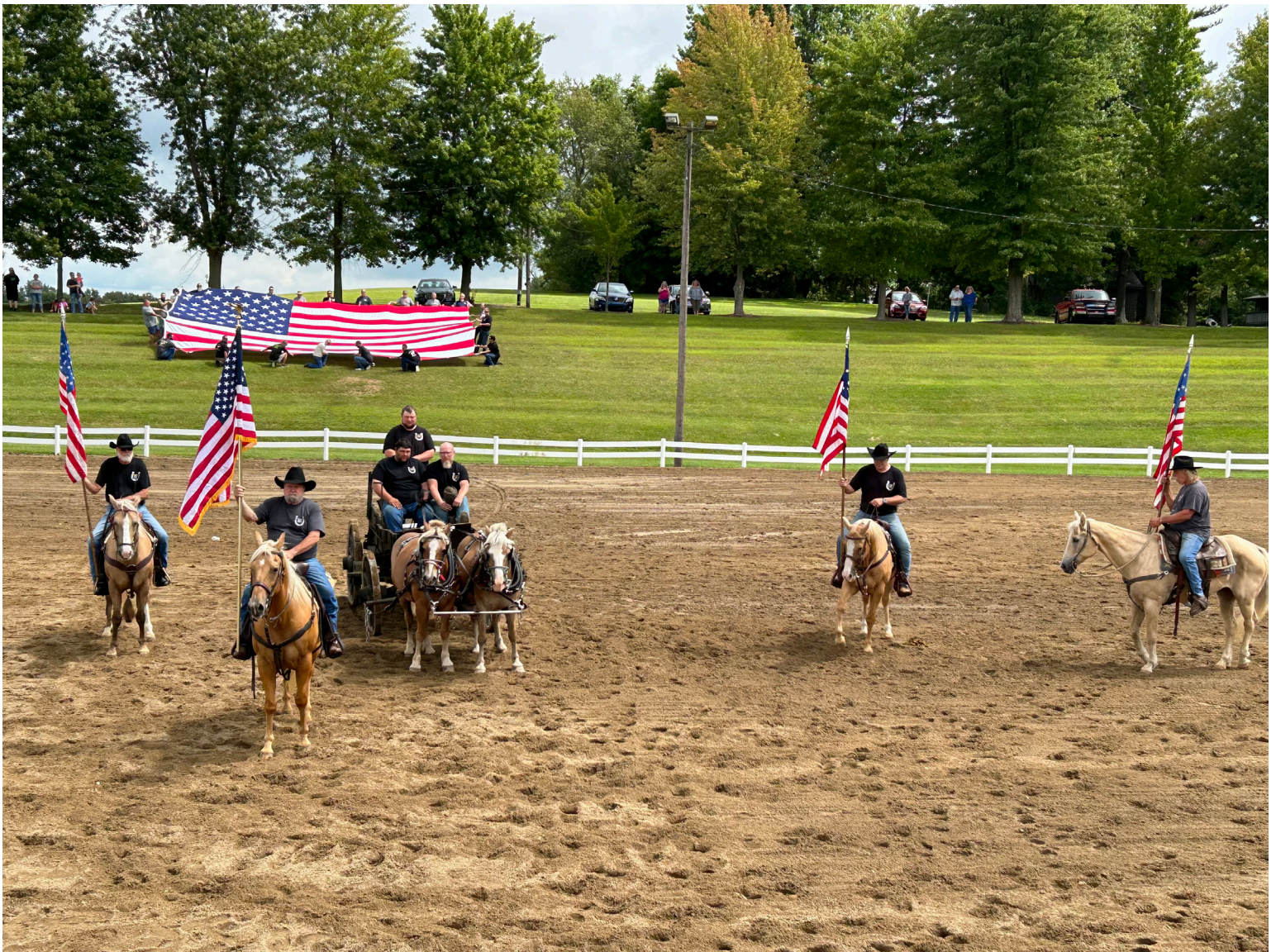
Mizpah Horse Patrol Flag Presentation 70th Annual Mizpah Charity Horse Show