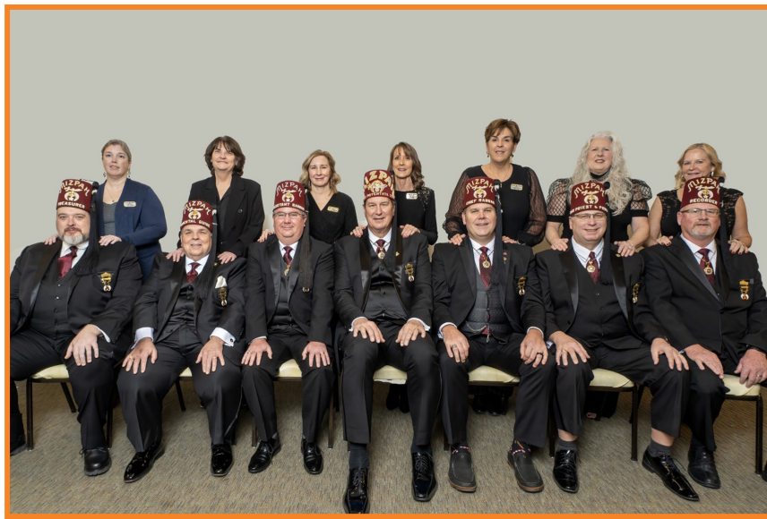
2023 Line Officers with their Ladies