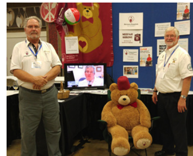
Allen County Conference on Youth