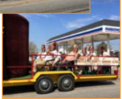
Columbia City Parade - June 27th