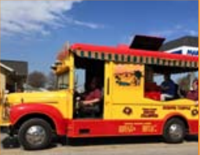
Shipshewana Parade - May 2nd