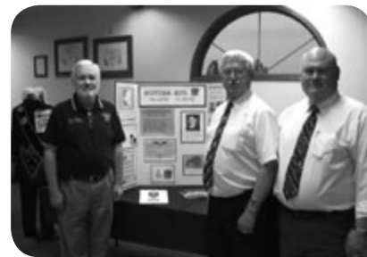
Pokagon Shrine "Meet & Greet"