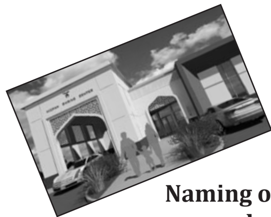
Naming of all common areas and specialty rooms

Take advantage of this unique way to leave a lasting legacy for those who will follow in your footsteps. Consider having a part of the new Mizpah Shrine Center named in honor of you or your company. This gift that will secure the future of Mizpah and the continuing work we will do in the future. Construction starts April 1 st , 2103 so act now.