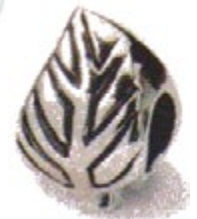
Ladies Party Bead