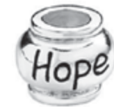
Potentate’s Ball Bead

Order forms available at www.mizpahshrine.com